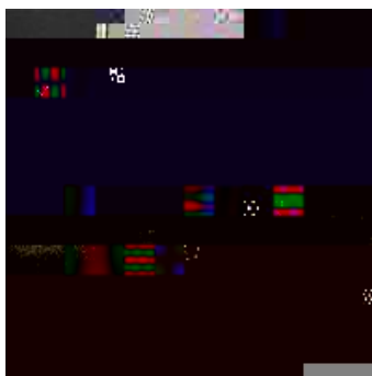
Left: Sketch of 1860 total solar eclipse showing a coronal mass ejection. Image: G. Temple/NASA.