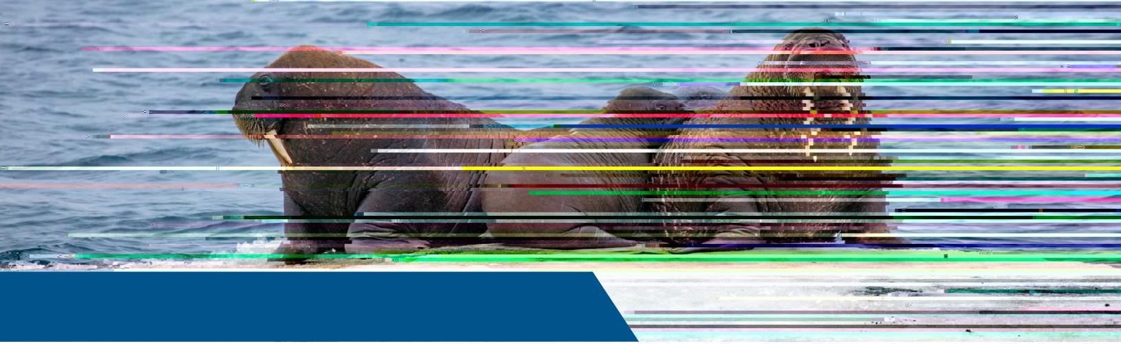
Walrus rest on sea ice in the Arctic.